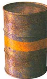
AGENT ORANGE 2,4-D; 2,4,5-T

USED: 1966-1972 PURPOSE: Defoliation of Jungle Vegetation IN VIETNAM: 104,800 drums (5,758,528 gallons)