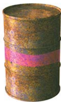
AGENT PINK 2,4,5-T

USED: 1962 PURPOSE: Defoliation of Jungle Vegetation IN VIETNAM: 365 drums (20,056 gallons)