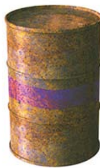
AGENT PURPLE 2,4-D; 2,4,5-T

USED: 1961-1963 PURPOSE: Defoliation of Jungle Vegetation IN VIETNAM: 1,315 drums (72,256 gallons)