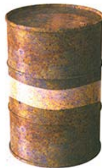
AGENT WHITE 2,4-D; Picloram

USED: 1966-1972 PURPOSE: Crop Destruction IN VIETNAM: 29,330 drums (1,611,619 gallons)