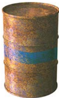
AGENT BLUE Cacodylic Acid

USED: 1962-1965 PURPOSE: Defoliation of Jungle Vegetation IN VIETNAM: 12,475 drums (685,474 gallons)