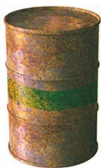
AGENT GREEN 2,4,5-T

The Rainbow Herbicides of the Vietnam War Era