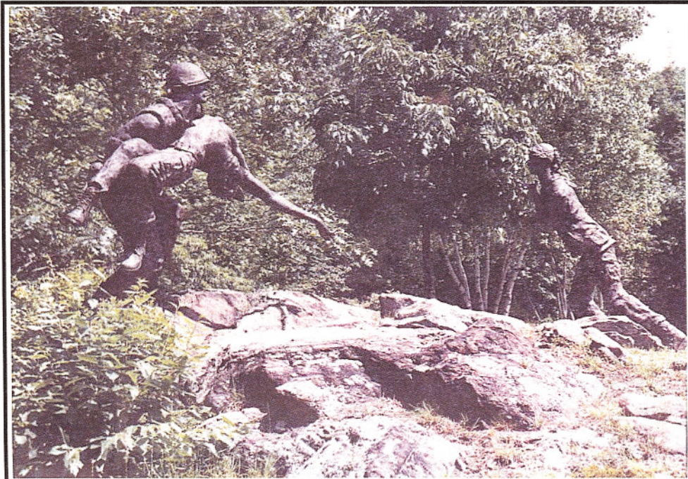
VIETNAM VETERANS MEMORIAL, LASDON PARK, SOMERS, NEW YORK