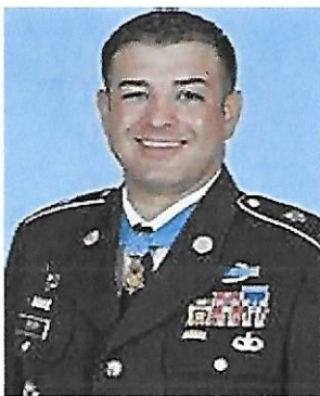
Leroy Petry GRAND MARSHAL Medal of Honor (Afghanistan) U.S. Army