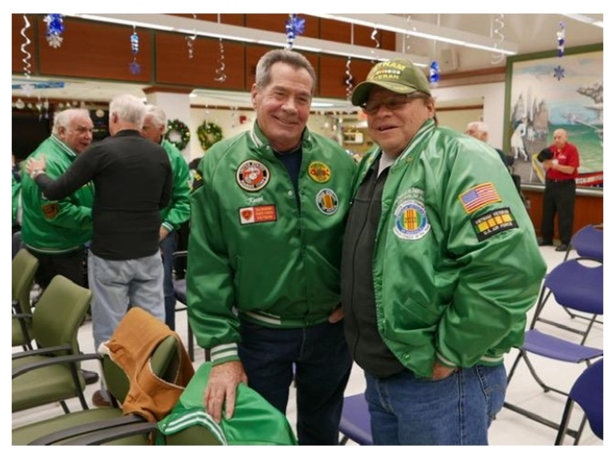
(Continue from pg. 14) Holiday Party at LI Nursing Home Hosted by VVA #11