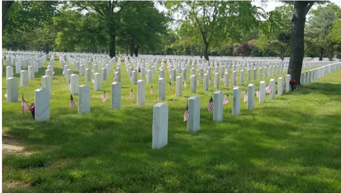
Long Island National Cemetery on Memorial Day—Pinelawn, Long Island