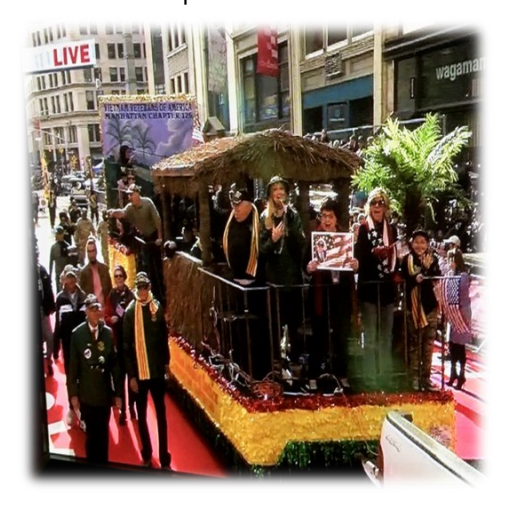
Veterans Day Parade

Some of our accomplishments this summer and fall were;