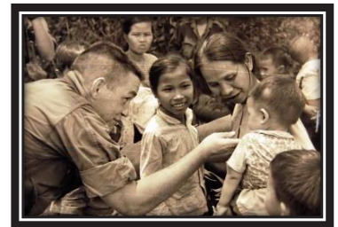
Tribute video narrated by Mr. Sam Elliott, and “Welcome Home!” event webpage.

Just before Memorial Day, in Issue 6 , we announced a Mark your Calendars invitation to join us next May 11-13, 2023 in Washington, D.C. , where large-scale events will be hosted on the National Mall to honor Vietnam veterans and their enduring legacy of service! This once- in-a-lifetime milestone event , spread across three days is appropriately titled “Welcome Home! A Nation Honors our Vietnam Veterans and their Families.” This event will feature Ceremonies on the National Mall, an Outdoor Multimedia Celebration , and a Walkable Avenue of Military Equipment, Interactive Displays and Mini-Stages.