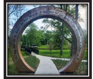
Arch in Vietnam Veterans Memorial Park in Trumbull, CT.

This quote (source unknown) is inscribed on the arch shown at right, surrounding the entrance to the Vietnam Veterans Memorial Park in Trumbull, Connecticut. Recently completed, the arch is a powerful tribute to all who gave their lives defending our Nation’s freedom in uniform, especially our Vietnam veterans.