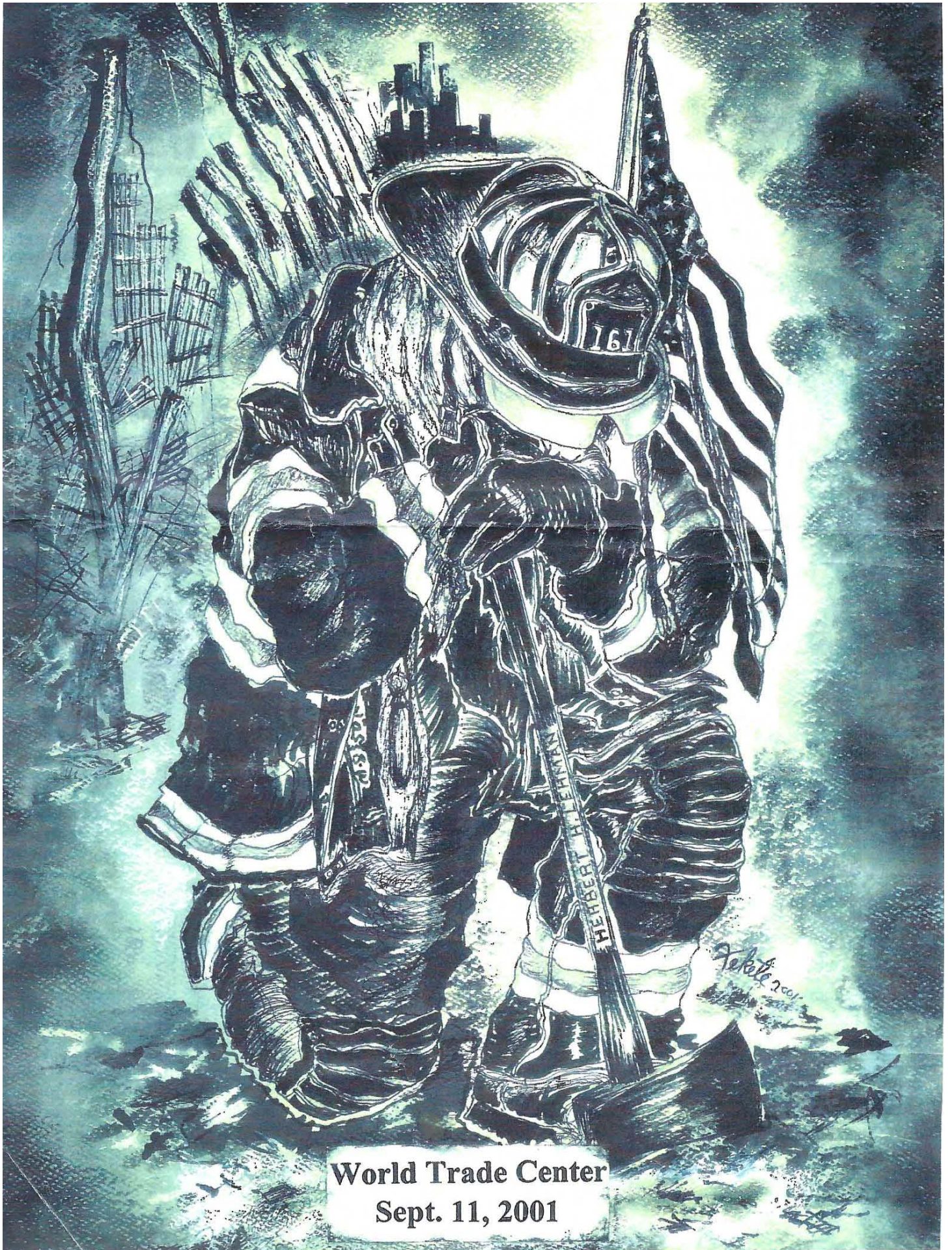
World Trade Center Sept. 11, 2001